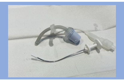
Handle the obturator by the large handle, and the trach tube by the flange. Then, place both parts on a clean dry towel or paper cloth.