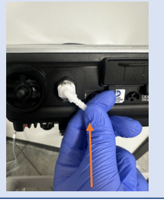
*If on oxygen disconnect the tubing before placing the ventilator into the case.