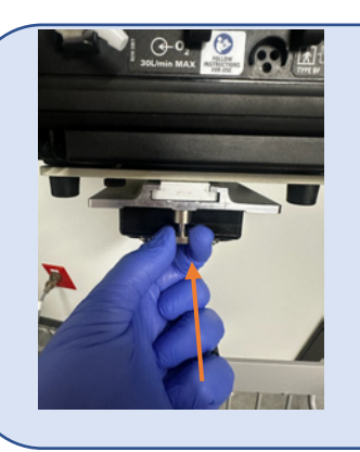
While pulling release, lift ventilator straight up to remove from bracket.