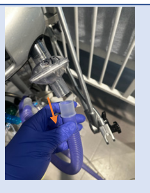
On the bottom of the ventilator, disconnect the "short" tubing between the bacterial filter and circuit.

Unplug the temp probe that is attached to the heater, ravel it up, and keep close. Before connecting the temp probes again, be sure to clean it off with alcohol wipes.