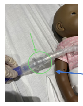
Whisper Swivel is clogged with secretions, do not throw away! Replace with a new or clean swivel and clean the dirty one.

Make sure the ventilator's power cord is attached appropriately to an outlet. You should see the charging symbol.