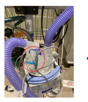
Temp probe dislodgment, (most common cause)