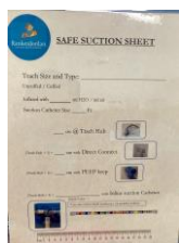
Safe Suction Depth