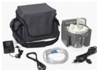
Portable Suction Machine