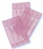
Saline Bullets to flush catheter